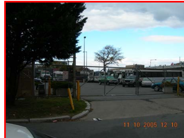
Van Street Lot