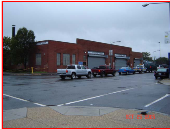
Southeastern Bus Garage